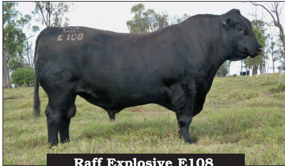
Raff Explosive E108

Raff Angus - BRED BY CATTLEMEN - NOT BY COMPUTERS