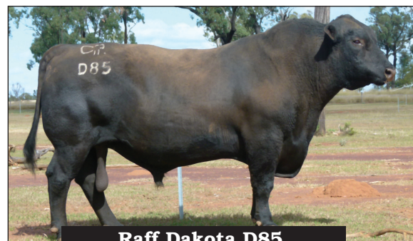
Raff Dakota D85