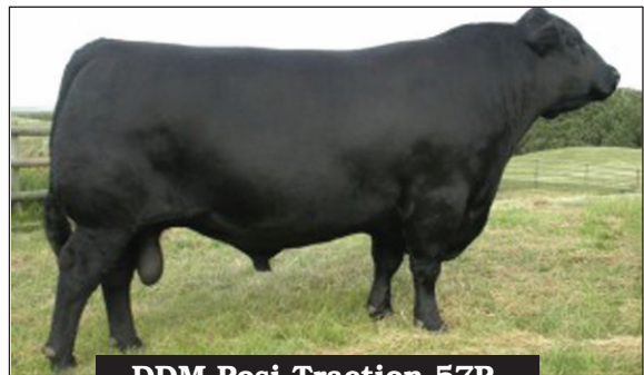
DDM Posi Traction 57P