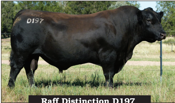
Raff Distinction D197

Raff Angus - WHERE PERFORMANCE IS REAL - NOT JUST A NUMBER