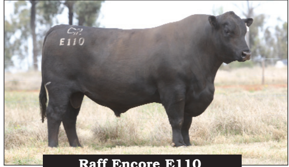
Raff Encore E110