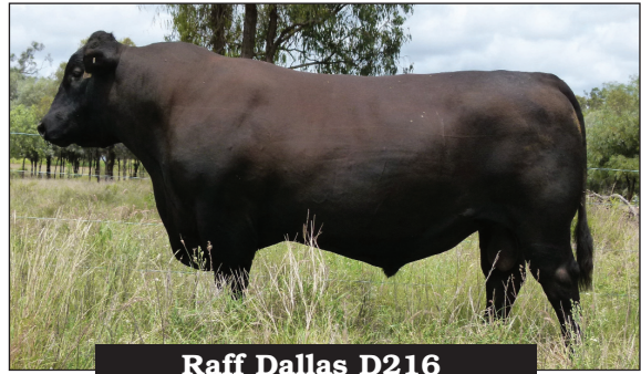
Raff Dallas D216