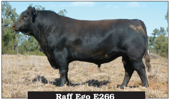
Raff Ego E266