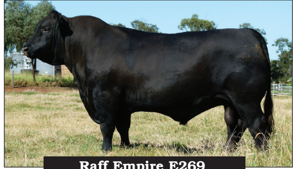
Raff Empire E269