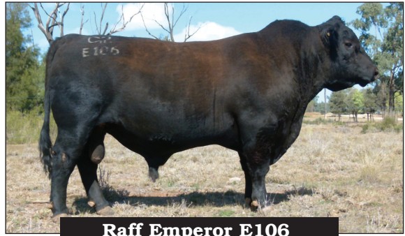
Raff Emperor E106