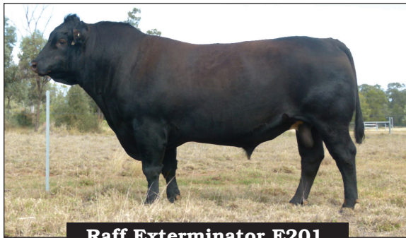
Raff Exterminator E201