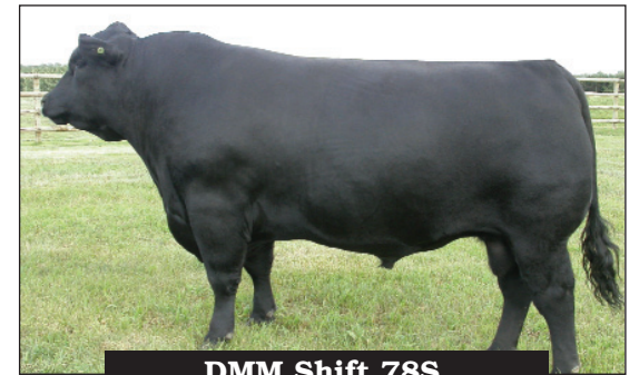
DMM Shift 78S