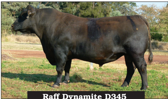
Raff Dynamite D345