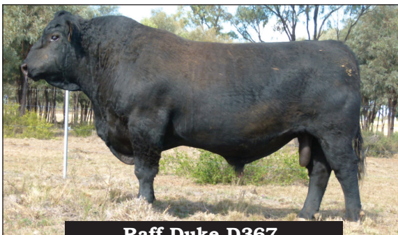
Raff Duke D367