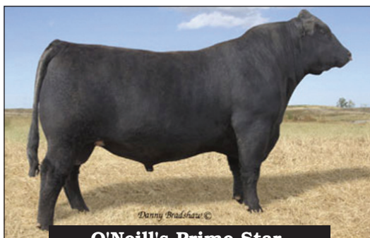
O'Neill's Prime Star