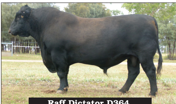
Raff Dictator D364