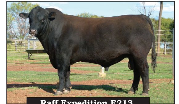
Raff Expedition E213