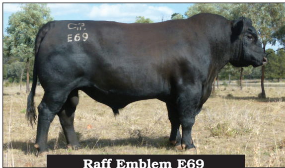
Raff Emblem E69